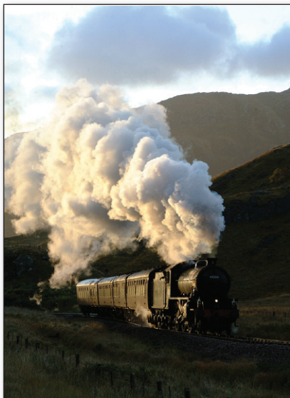
No. 62005 climbs away from Glenfinnan early in the morning of 7 October 2003.