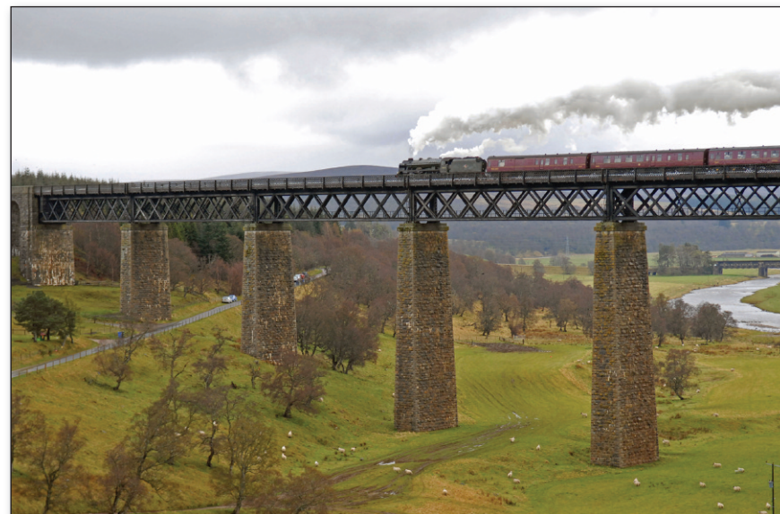
LMS Royal Scot 4-6-0 No. 46115 Scots Guardsman crosses Findhorn viaduct over the River Findhorn through Strathdearn on the climb to Slochd, running from Inverness to Glasgow.