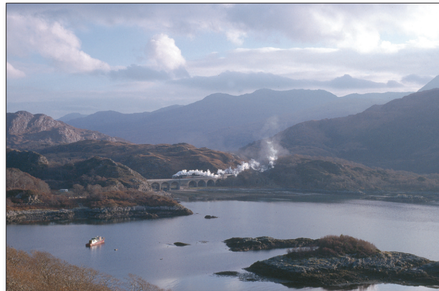
Seen from above the first tunnel at Beasdale, LMS 'Black Five' 4-6-0 No. 5305 crosses the distant Lochnan-Uamh viaduct on 1 December 1989.