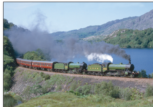
LNER K4 2-6-0 No. 3442 The Great Marquess and LNER K1 2-6-0 No. 2005 climb away from Loch nan-Uamh above the waters of Loch Dubh.