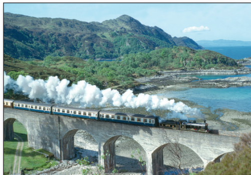
Right: Maude reaches the west coast and crosses Loch nan-Uamh viaduct on 28 May 1984.