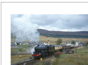
LMS 'Black Five' 4-6-0 No. 5025 departs from Achnashieen on 5 October 1902.